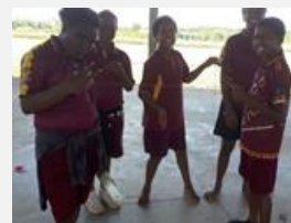
Using wool to construct a cubic metre!